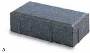
a) Monroe® – 4" x 8"

All stocked Monroe® pavers are 2 3 / 8 " thick Monroe Pavers also available 3 1 / 8 " thick