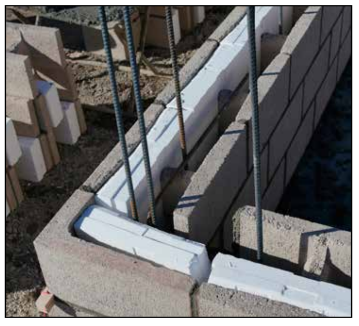
Insulated corners are built using conventional masonry fittings and Hi-R H units