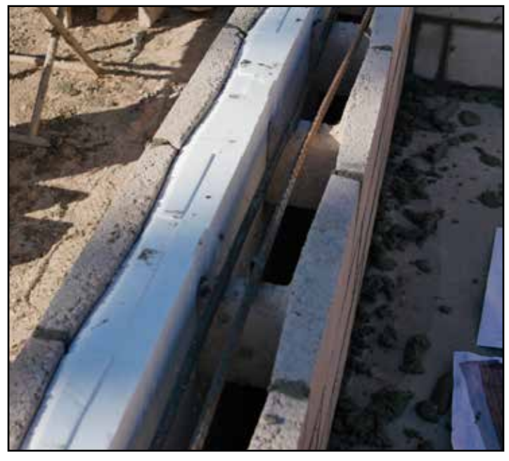
Hi-R H units are suitable for construction of bond beams without the need for any modifications to the units and the insulation inserts remain fully in place

10" Wide Hi-R H may also be available in some markets. Please check with your Concrete Products Group representative for local availablity.