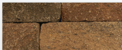
Canyon Creek Blend