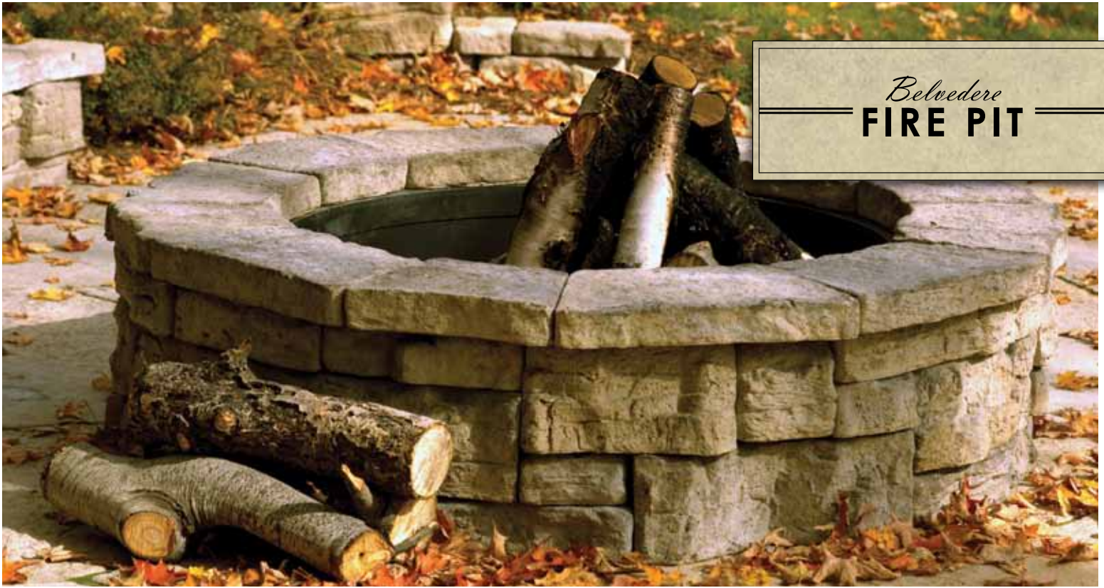
Belvedere FIRE PIT