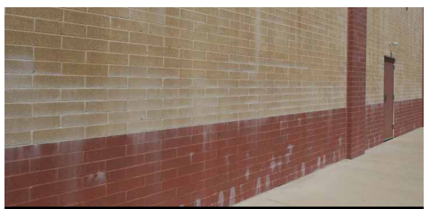
A failure to protect the exposed wall tops from rain during construction can lead to the wall's empty cores filling with water, which as it drains out of the wall leaches salts from the concrete which results in efflorescence forming on the exterior. This makes cleaning the wall much more difficult

Use a Suitable Integral Water Repellent in the Mortar.