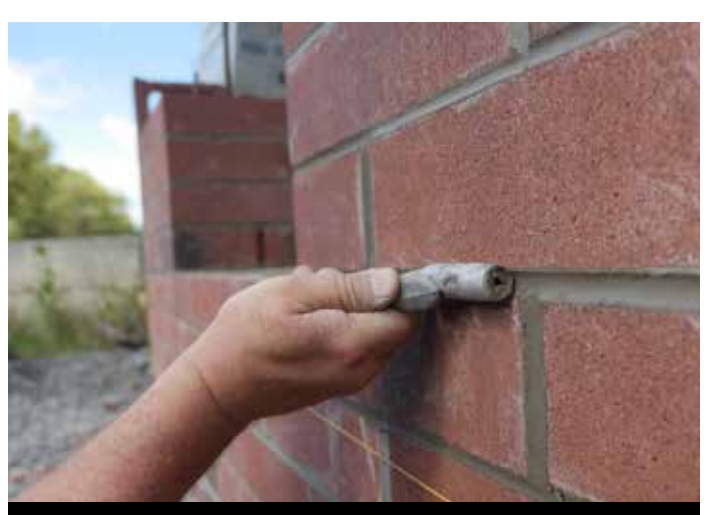
Tool Joints when they have reached thumb-print hardness for best results

For partially grouted walls, a suitable flashing and weep system should be placed at any interruptions in the drainage path in the wall's cores, including foundation bond beams, sills, lintels, bond beams at load bearing areas such as floors or roofs or bond beams at other locations. For fully grouted walls, flashing should be used at any locations where water may collect on the exterior of the wall and potentially penetrate to the interior, such as at sill or wall top locations. Proper flashing and weep design will allow water to drain out of the wall so that it will not be left in the wall to cause efflorescence stains.