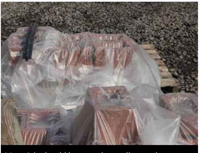
Materials should be stored on pallets and protected from the elements while stored on site