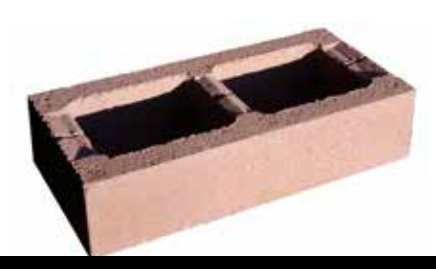
Drainage Zones Shown on top of WCT™ block

Tool joints when mortar reaches "thumb-print hardness" and be consistent about this. If a joint is tooled too soon, shrinkage cracks at the mortar/block interface are likely to occur and the final mortar color may be very light. If the joint is tooled too late the color becomes very dark and the mortar may not be plastic enough to seal properly against the masonry units. If wall sections are tooled when the mortar is at inconsistent degrees of hardness, the overall look of the wall will be significantly affected by the resulting differences in mortar color. Use a concave joint to avoid collection of moisture at the mortar joints.