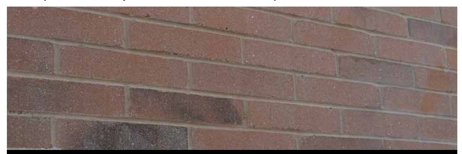
Cleaned Wall Section showing discoloration and damage due to use of high pressure rinse - note the wand marks where the wall was particularly hard hit (water pressure was 500 psi)

• Use Low Water Pressure for Applying the Cleaner and Rinsing it Off - Preferably 50 psi or Less. Use of pressure washers set at high pressure to clean walls is extremely risky due to multiple problems this practice will cause. These include: (1) the formation of post-cleaning efflorescence by driving water under high pressure into the concrete masonry, and (2) defacing the wall with unslightly streaks and altering the texture and color of the wall. High pressure washing will actually scour the cement paste off of the surface of the wall, particularly when used to rinse off an acid based cleaner, and in extreme cases this can compromise the wall's ability to resist moisture penetration. You should never use more water pressure than you could tolerate if the water stream were directed at your hand.