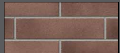
Syracuse Blend Light Brown with Burgundy Flash

The colors above are digital renderings of blended Spec-Brik colors. Due to the limitations of the printing process and the importance of viewing masonry materials under realistic site lighting conditions, we strongly recommend viewing a sample board before making color selections and using a jobsite sample panel as the basis for acceptance of the final work.