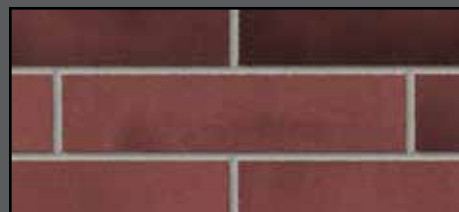
Stanton Blend Red with Black Flash