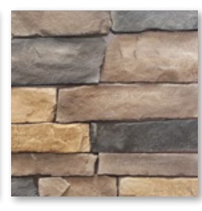
Rustic Gray Tuscan