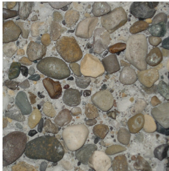
Exposed Aggregate #2 Pea Gravel 1/2" Top Size