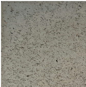
Light Sandblast Texture Natural Concrete Color