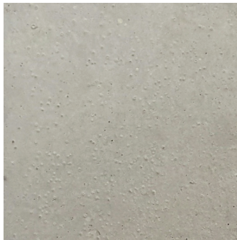
Smooth As-Cast Surface Natural Concrete Color