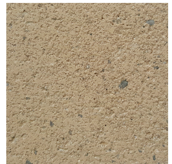
Light Buff PC215