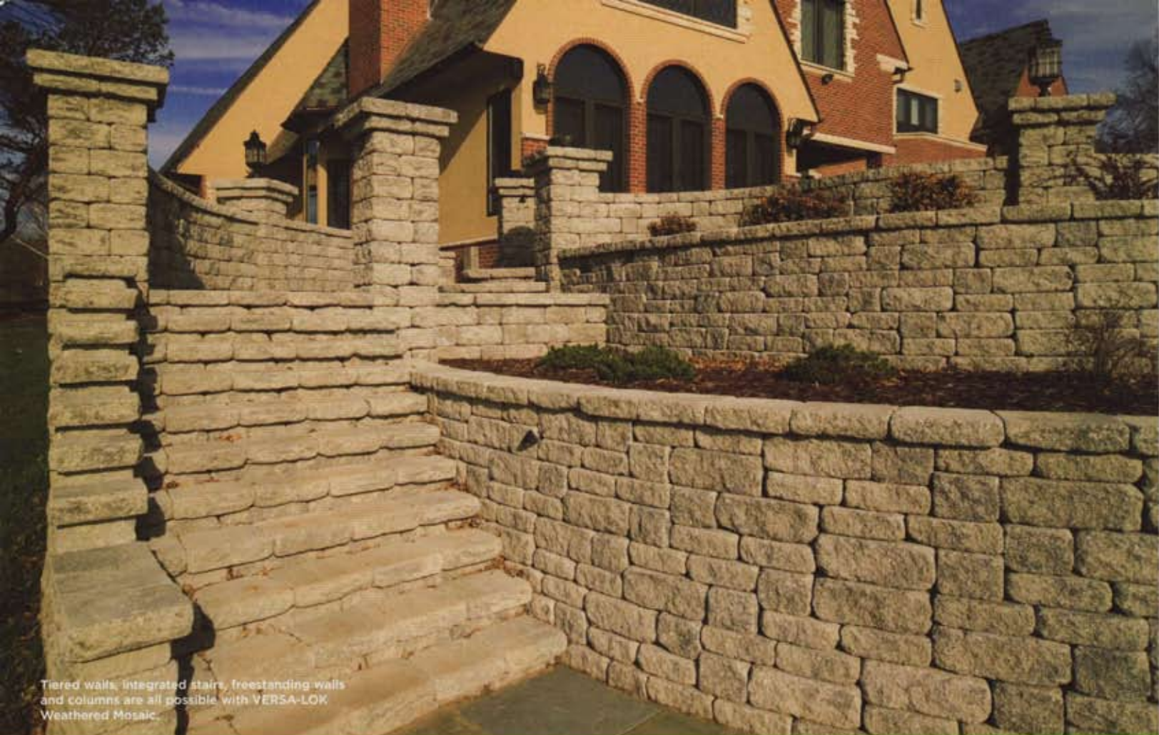
Tiered walls, integrated stairs, freestanding walls and columns are all possible with VERSA-LOK Weathered Mosaic.

No matter how challenging your landscaping problem may be, there's a VERSA-LOK® retaining wall system that can resolve it with engineered elegance.