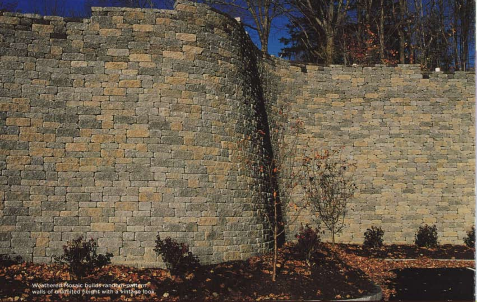
Weathered Mosaic builds random-pattern walls of unlimited height with a vintage look