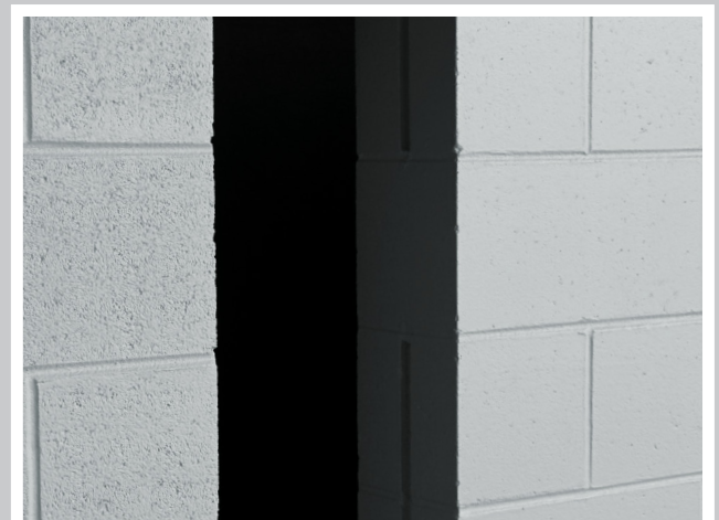
Ordinary CMU (left) and Spec-Surface, each with two coatings of paint.