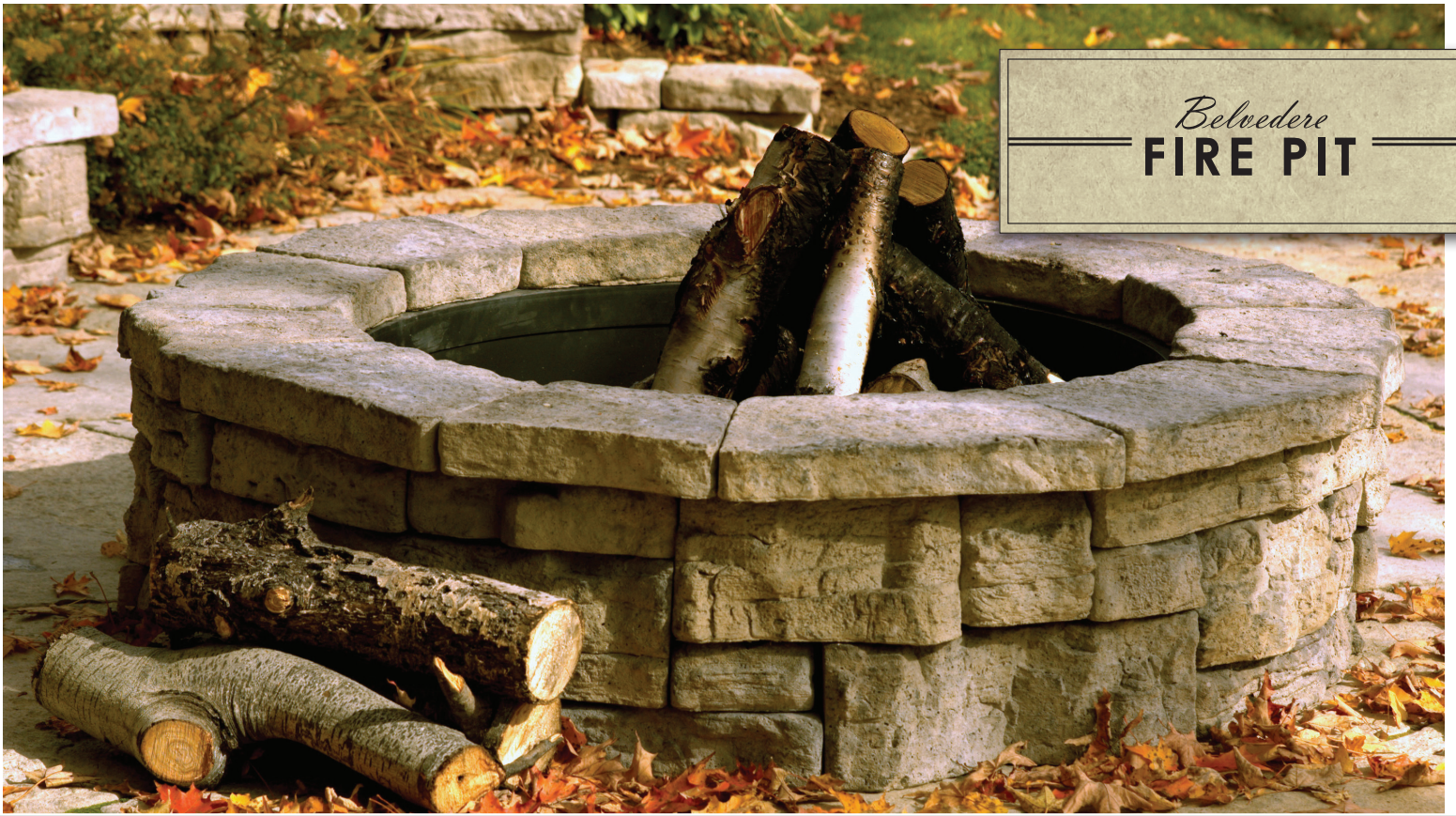
Belvedere FIRE PIT